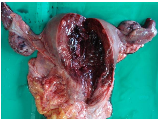
Figure 1: Blood clots in the uterus

Serious complications are resulted from illegal abortion causing morbidity and mortality. Reducing maternal mortality by preventing illegal abortion is a challenge. Mostly ethical, religious and political obligations prevent discussion on health values to prevent maternal deaths from illegal abortions. Therefore we need to initiate a discussion among medical and legal community to reduce the number of maternal deaths from illegal abortions.